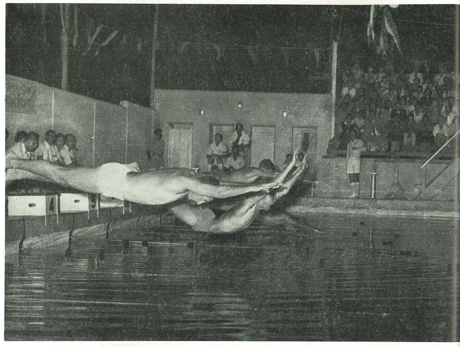
The start of a race held at the Suva City sea baths.